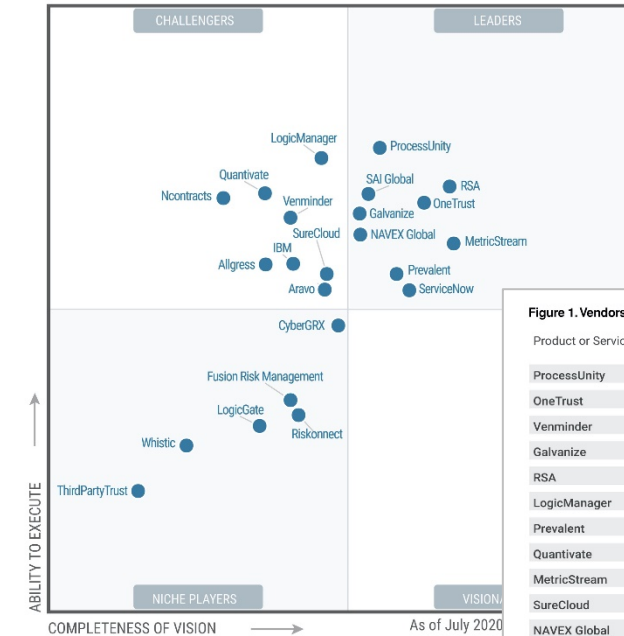
Figure 1. Vendors' Product Scores for the VRM Solution Use Case