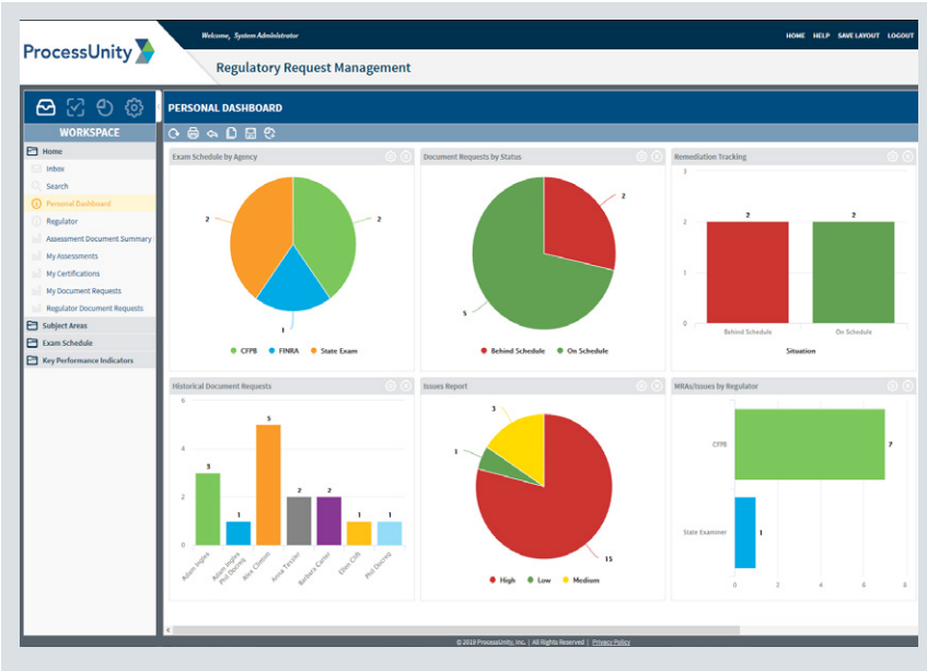
Customizable, personal dashboards display scheduled exams, key milestones, issues uncovered to date by source, historical document requests and more.

Responding to a regulator or auditor's document request usually requires data from multiple parties within your organization. ProcessUnity's tools simplify and automate elements of the document request process - shortening response times while reducing the stress of everyone involved. For exams and audits, ProcessUnity's Exam Management system creates the unique processes and milestones associated with the exam for progress and reporting purposes. Regardless of the type of document request, ProcessUnity allows you to collect, organize and assign requests to individuals across your organization. To increase transparency and accountability, the solution can assign due dates with automatic reminders for every type of document request.